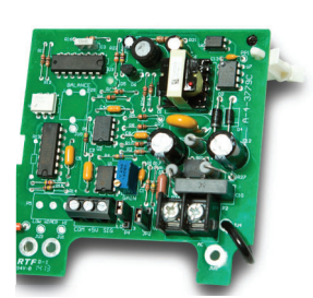
-55H2 option board