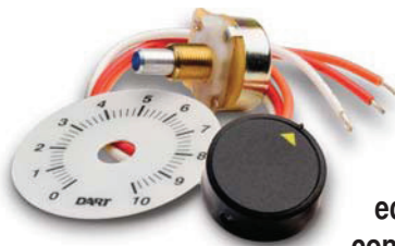
Speed Potentiometer Kit Included

The 65 Series controls are high performance PWM controls for 12, 24, and 36 volt battery powered equipment providing smooth control with high efficiency operation. The advanced design permits a substantial increase in the equipment running time between charges over conventional techniques. Features include adjustable maximum speed, minimum speed, current limit, I.R. compensation, and acceleration. The adjustable current limit feature protects the control, battery, and motor from sustained overloads. The higher capacity models also provide thermal protection.