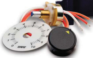
Speed Potentiometer Kit Included