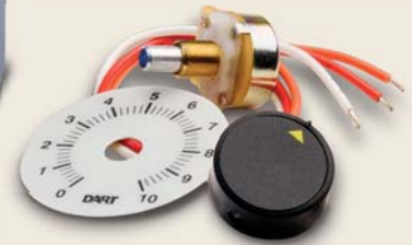
Speed Potentiometer Kit Included