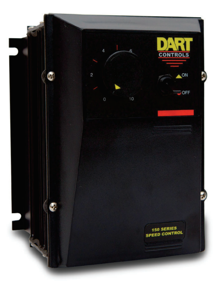
153D -E Series