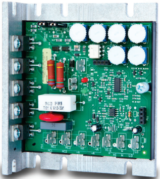
153 -C Series